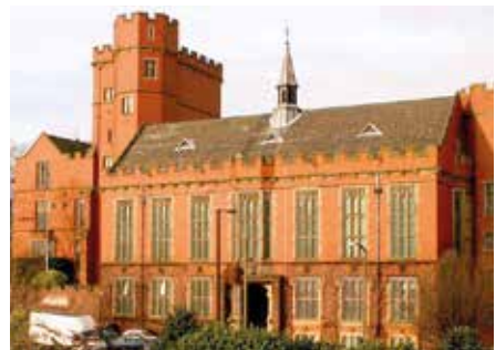
A Sheffield University building