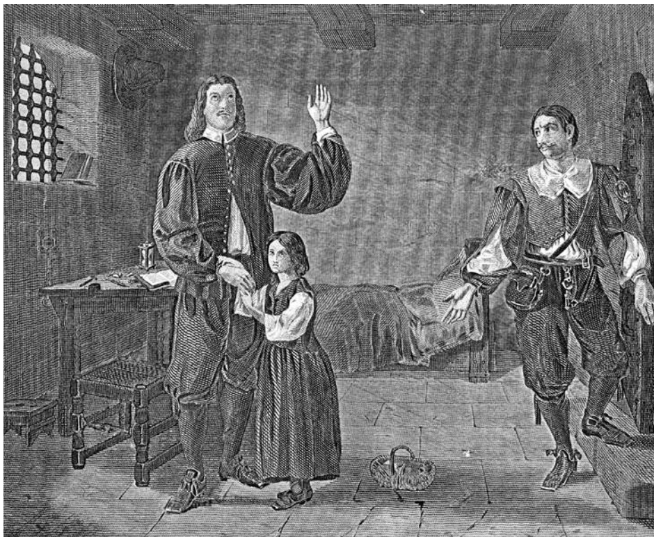
John Bunyan spent twelve years in Bedford county jail (1660 – 1672) for the right to preach the Gospel freely in Britain

Thirdly, political parties have tried to win elections by seeking votes from minority groups. This has led to them playing “identity politics” and facilitating the agendas of such groups, without giving due consideration to the effect on other groups.